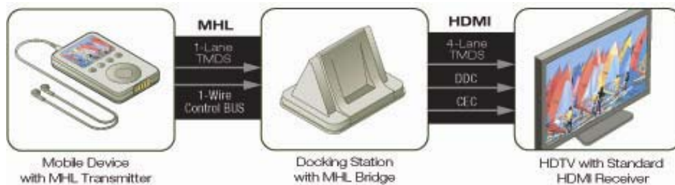
FIGURE 1: MHL Transmitter, Bridge and HDMI Receiver Implementation

MHL technology-enabled mobile devices will connect to the DTV via a docking station or dongle, which includes an MHL-to-HDMI bridge IC that performs the conversion from the uncompressed MHL video signals into standard HDMI compatible signals. The docking station is equipped with a standard HDMI output connector, allowing the docking station to be plugged directly into HDTVs. The docking station can also pass DC power to the mobile device to charge the battery when the device is in the dock.